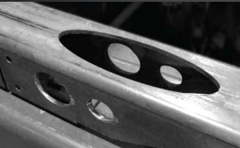
MARKING AND CUTTING ON 4 FACES